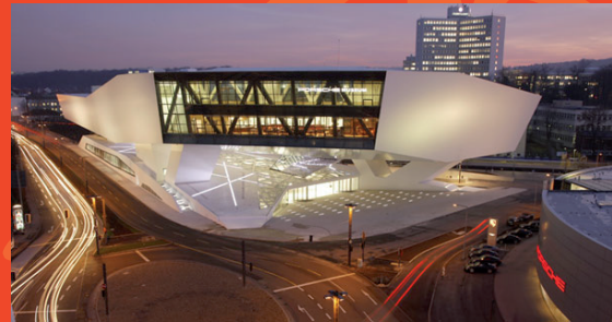
Technical museums of Porsche and Mercedes Benz