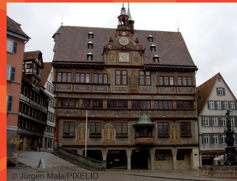
Inspiring Youthwork in local YMCA's and historical places